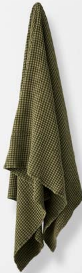
WAFFLE COTTON THROW IN OLIVE $169