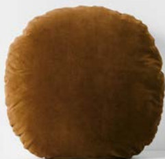
LUXURY VELVET 55CM ROUND CUSHION IN TOBACCO $79.95