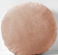
LUXURY VELVET 55CM ROUND CUSHION IN ROSEWATER $79.95