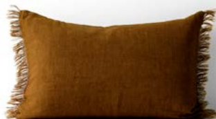
VINTAGE LINEN FRINGE 35 X 55 CUSHION IN TOBACCO $59.95