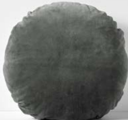
LUXURY VELVET 55CM ROUND CUSHION IN CHARCOAL $79.95