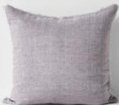
VINTAGE LINEN FRINGE CUSHION IN LILAC $59.95