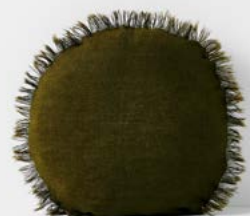
VINTAGE LINEN FRINGE ROUND CUSHION IN KHAKI $69.95