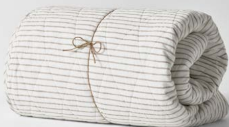
VINTAGE STRIPE BEDCOVER IN MINK 260x240 $299