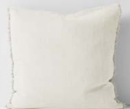
CHAMBRAY LINEN CUSHION IN MARSHMALLOW $69.95