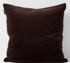
LUXURY VELVET CUSHION IN FIG $59.95