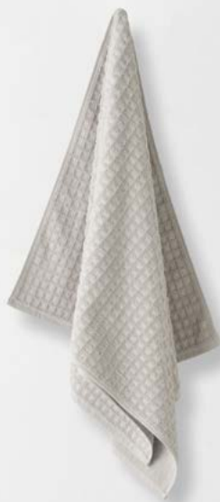
WAFFLE TOWEL IN NATURAL