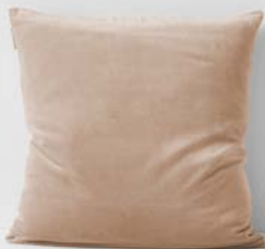
LUXURY VELVET CUSHION IN NUDE $59.95