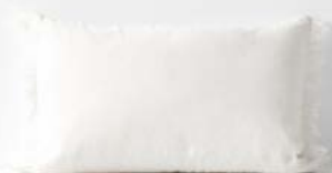
VINTAGE LINEN FRINGE 35 X 55 CUSHION IN MARSHMALLOW $59.95