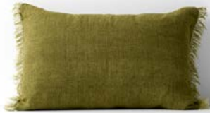
VINTAGE LINEN FRINGE 35 X 55 CUSHION IN OLIVE $59.95