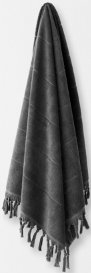
PAROS TOWEL IN CHARCOAL