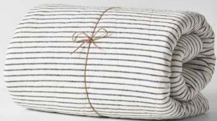
VINTAGE STRIPE BEDCOVER IN INK 260x240 $299