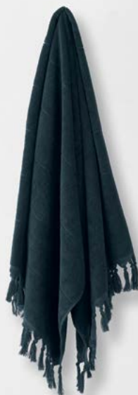
PAROS TOWEL IN SLATE