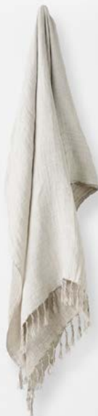
DOUBLE LAYER THROW IN MARSHMALLOW $179