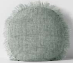
VINTAGE LINEN FRINGE ROUND CUSHION IN LIMESTONE $69.95