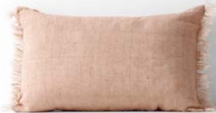
VINTAGE LINEN FRINGE 35 X 55 CUSHION IN CLAY $59.95