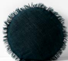
VINTAGE LINEN FRINGE ROUND CUSHION IN SLATE $69.95