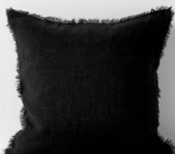
VINTAGE LINEN FRINGE CUSHION IN BLACK $59.95