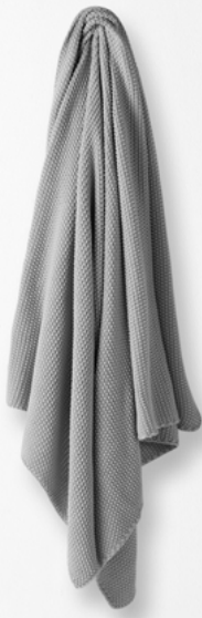
JUMBO MOSS STITCH COTTON THROW IN GREY MARLE $199