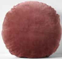
LUXURY VELVET ROUND CUSHION IN MAHOGANY $69.95