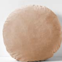
LUXURY VELVET ROUND CUSHION IN NUDE $69.95