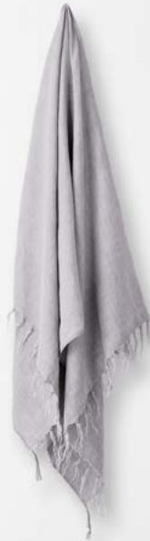
VINTAGE LINEN FRINGE THROW IN LILAC $149