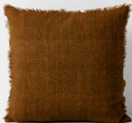
VINTAGE LINEN FRINGE CUSHION IN TOBACCO $59.95