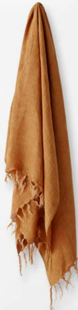
VINTAGE LINEN FRINGE THROW IN CINNAMON $149