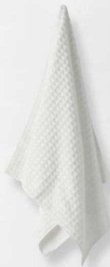
WAFFLE TOWEL IN WHITE