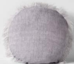
VINTAGE LINEN FRINGE ROUND CUSHION IN LILAC $69.95