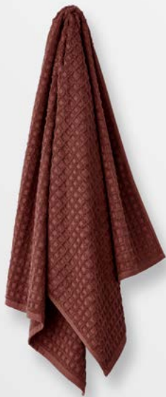
WAFFLE TOWEL IN MAHOGANY