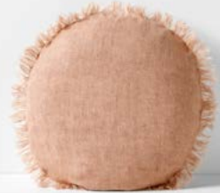
VINTAGE LINEN FRINGE ROUND CUSHION IN CLAY $69.95