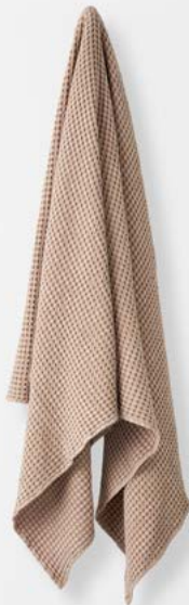
WAFFLE COTTON THROW IN NUDE $169