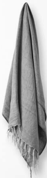
VINTAGE LINEN FRINGE THROW IN SMOKE $149