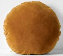
LUXURY VELVET ROUND CUSHION IN GINGER $69.95