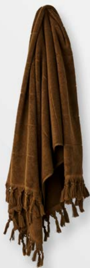
PAROS TOWEL IN TOBACCO