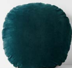
LUXURY VELVET 55CM ROUND CUSHION IN INDIAN TEAL $79.95