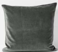
LUXURY VELVET CUSHION IN CHARCOAL $59.95