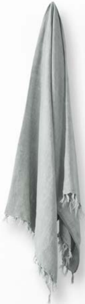
VINTAGE LINEN FRINGE THROW IN LIMESTONE $149