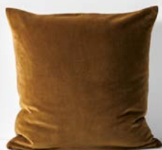
LUXURY VELVET CUSHION IN TOBACCO $59.95