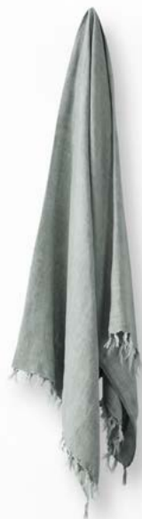
VINTAGE LINEN FRINGE THROW IN MIST $149