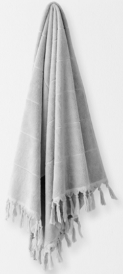
PAROS TOWEL IN DOVE