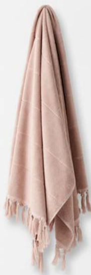
PAROS TOWEL IN PINK CLAY