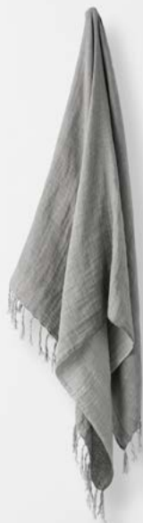
DOUBLE LAYER THROW IN SMOKE $179