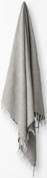
VINTAGE LINEN FRINGE THROW IN MINK $149