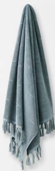
PAROS TOWEL IN EUCALYPT