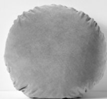
LUXURY VELVET ROUND CUSHION IN PEBBLE $69.95