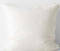
VINTAGE LINEN FRINGE CUSHION IN MARSHMALLOW $59.95