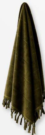
PAROS TOWEL IN KHAKI