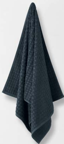
WAFFLE TOWEL IN SLATE