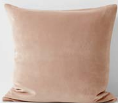
LUXURY VELVET CUSHION IN ROSEWATER $59.95