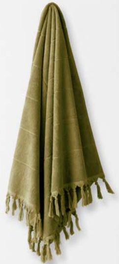
PAROS TOWEL IN OLIVE