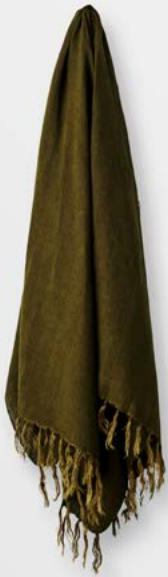
VINTAGE LINEN FRINGE THROW IN KHAKI $149