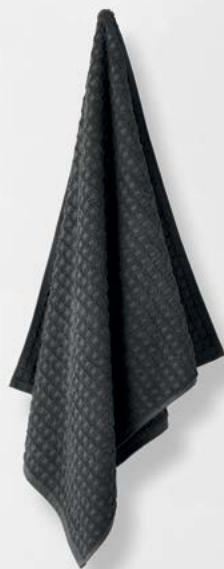
WAFFLE TOWEL IN CHARCOAL