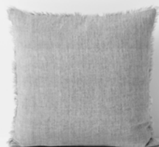
VINTAGE LINEN FRINGE CUSHION IN SMOKE $59.95