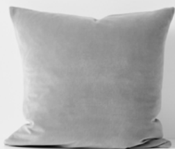
LUXURY VELVET CUSHION IN PEBBLE $59.95