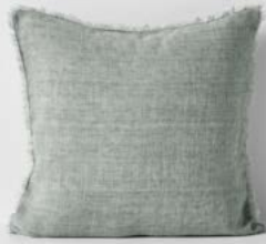
VINTAGE LINEN FRINGE CUSHION IN LIMESTONE $59.95