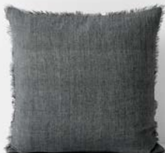
VINTAGE LINEN FRINGE CUSHION IN CHARCOAL $59.95