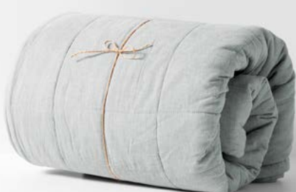
CHAMBRAY BEDCOVER IN LIMESTONE 260x240 $299