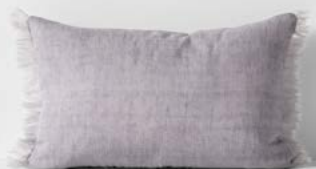
VINTAGE LINEN FRINGE 35 X 55 CUSHION IN LILAC $59.95