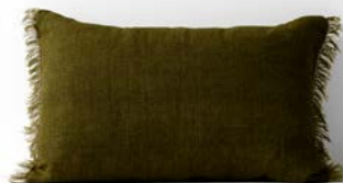
VINTAGE LINEN FRINGE 35 X 55 CUSHION IN KHAKI $59.95