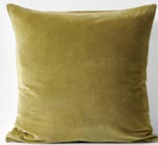
LUXURY VELVET CUSHION IN OLIVE $59.95