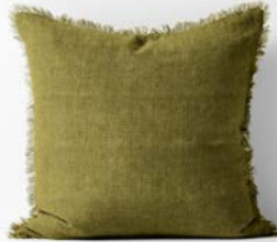
VINTAGE LINEN FRINGE CUSHION IN OLIVE $59.95