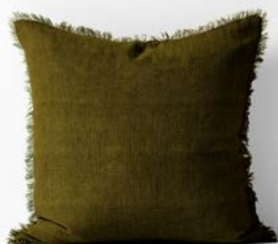
VINTAGE LINEN FRINGE CUSHION IN KHAKI $59.95