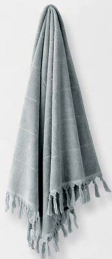
PAROS TOWEL IN LIMESTONE