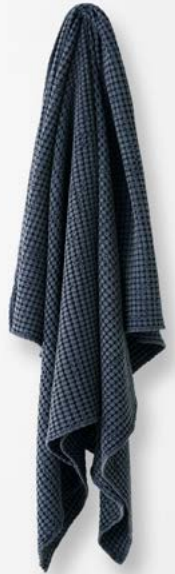
WAFFLE COTTON THROW IN SLATE $169