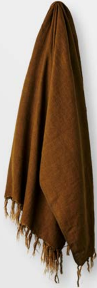
VINTAGE LINEN FRINGE THROW IN TOBACCO $149