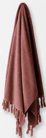
PAROS TOWEL IN MAHOGANY