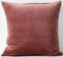
LUXURY VELVET CUSHION IN MAHOGANY $59.95