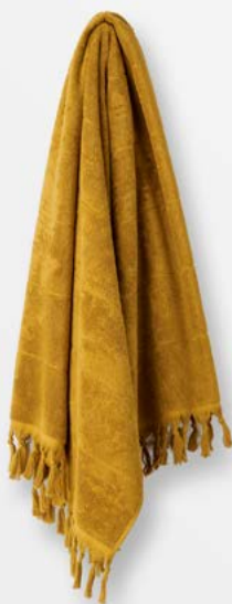
PAROS TOWEL IN MUSTARD