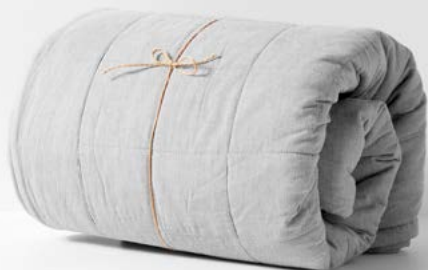
CHAMBRAY BEDCOVER IN DOVE 260x240 $299