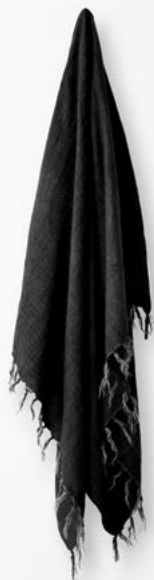
VINTAGE LINEN FRINGE THROW IN BLACK $149