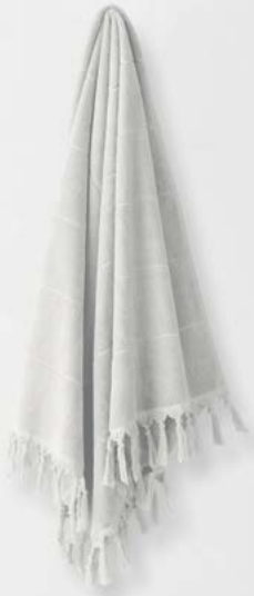
PAROS TOWEL IN WHITE