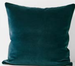
LUXURY VELVET CUSHION IN INDIAN TEAL $59.95