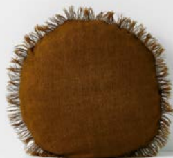
VINTAGE LINEN FRINGE ROUND CUSHION IN TOBACCO $69.95