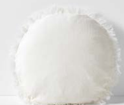
VINTAGE LINEN FRINGE ROUND CUSHION IN MARSHMALLOW $69.95