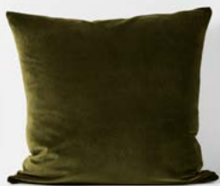
LUXURY VELVET CUSHION IN KHAKI $59.95