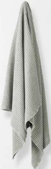
WAFFLE COTTON THROW IN LIMESTONE $169