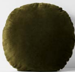
LUXURY VELVET 55CM ROUND CUSHION IN KHAKI $79.95