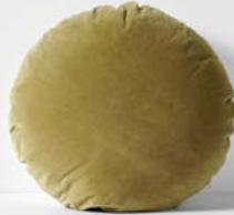
LUXURY VELVET ROUND CUSHION IN OLIVE $69.95