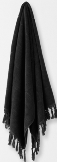
PAROS TOWEL IN BLACK