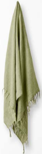
VINTAGE LINEN FRINGE THROW IN WILLOW $149