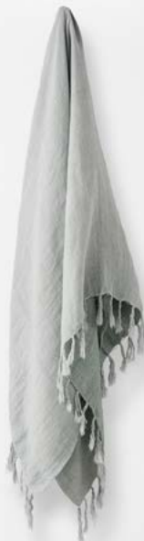
DOUBLE LAYER THROW IN LIMESTONE $179