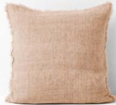
VINTAGE LINEN FRINGE CUSHION IN CLAY $59.95