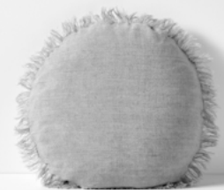
VINTAGE LINEN FRINGE ROUND CUSHION IN SMOKE $69.95