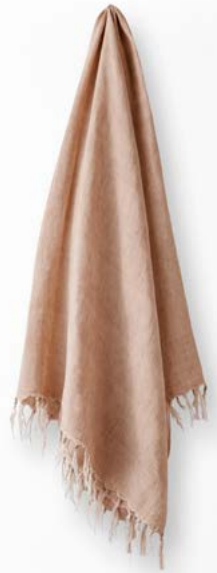
VINTAGE LINEN FRINGE THROW IN CLAY $149