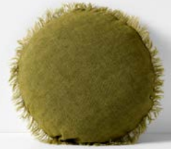
VINTAGE LINEN FRINGE ROUND CUSHION IN OLIVE $69.95