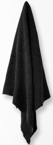
WAFFLE COTTON THROW IN BLACK $169