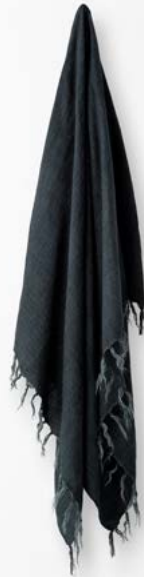
VINTAGE LINEN FRINGE THROW IN SLATE $149