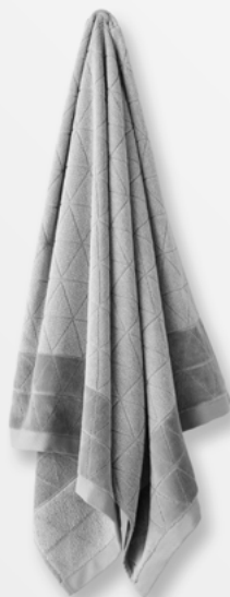
CHAMBRAY BORDER TOWEL IN DOVE