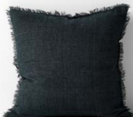
VINTAGE LINEN FRINGE CUSHION IN SLATE $59.95