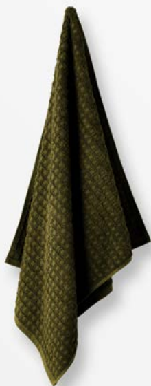
WAFFLE TOWEL IN KHAKI