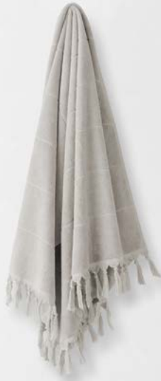
PAROS TOWEL IN NATURAL