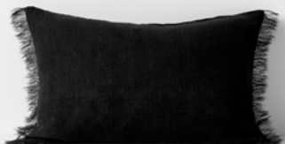
VINTAGE LINEN FRINGE 35 X 55 CUSHION IN BLACK $59.95