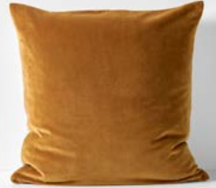
LUXURY VELVET CUSHION IN GINGER $59.95