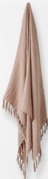
DOUBLE LAYER THROW IN CLAY $179