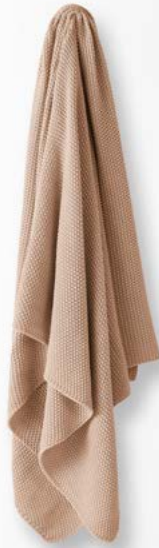
JUMBO MOSS STITCH COTTON THROW IN CLAY $199