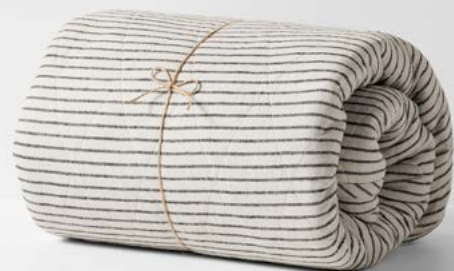
VINTAGE STRIPE BEDCOVER IN BLACK 260x240 $299