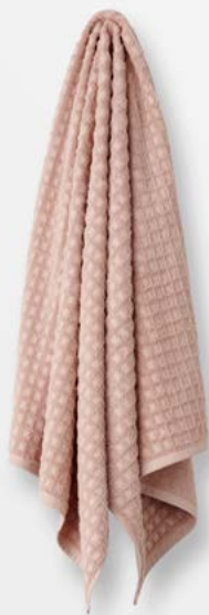
WAFFLE TOWEL IN CLAY