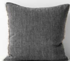
CHAMBRAY LINEN CUSHION IN BLACK $69.95