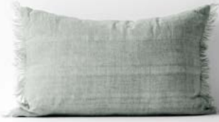
VINTAGE LINEN FRINGE 35 X 55 CUSHION IN LIMESTONE $59.95