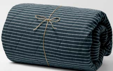
VINTAGE STRIPE BEDCOVER IN SLATE 260x240 $299