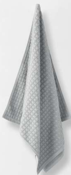
WAFFLE TOWEL IN DOVE