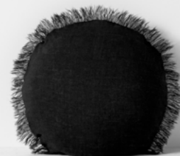
VINTAGE LINEN FRINGE ROUND CUSHION IN BLACK $69.95