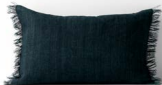
VINTAGE LINEN FRINGE 35 X 55 CUSHION IN SLATE $59.95