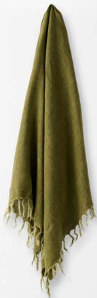
VINTAGE LINEN FRINGE THROW IN OLIVE $149